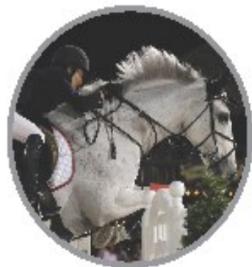
USEF NETWORK.COM Changing the way you look at equestrian sport