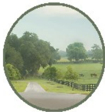
UNITED STATES EQUESTRIAN FEDERATION The national governing body for equestrian sport

Emerald Classic I(329509), Emerald Coast Classic II(329510), "National Rated" Green Working Hunter, Green Confirmation Hunter, Regular Working Hunter, Regular Confirmation Hunter, Amateur Owner Hunter, Junior Hunter, Green Pony Hunter, Pony Hunter; rated "C" Hunter Breeding, Pony Hunter Breeding, Pre-Green Hunter, Children's Hunter, Adult Amateur Hunter, Children's Pony Hunter.