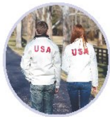
shopUSEF.com A fresh approach to classic equestrian style