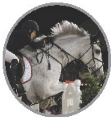
USEF NETWORK.COM Changing the way you look at equestrian sport