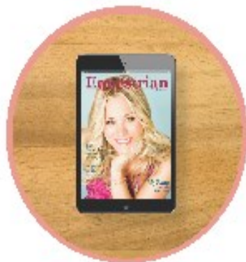
Equestrian The official magazine of the USEF