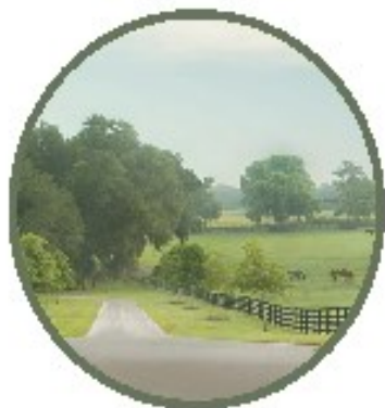
UNITED STATES EQUESTRIAN FEDERATION The national governing body for equestrian sport

Children's/Adult will be combined if there is less than 8 entries in any one section. With the prize money raised to $1500 with a entry fee of $150. Junior/Amateur will be combined if there is less than 8 entries in any one section. Needs 8