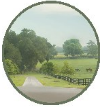
UNITED STATES EQUESTRIAN FEDERATION The national governing body for equestrian sport

Pensacola Summer Classic I(327536), Pensacola Summer Classic II(327537), "National Rated" Green Working Hunter, Green Confirmation Hunter, Regular Working Hunter, Regular Confirmation Hunter, Amateur Owner Hunter, Junior Hunter, Green Pony Hunter, Pony Hunter; rated "C" Hunter Breeding, Pony Hunter Breeding, Pre-Green Hunter, Children's Hunter, Adult Amateur Hunter, Children's Pony Hunter.