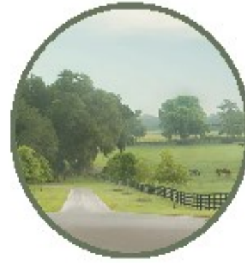
UNITED STATES EQUESTRIAN FEDERATION The national governing body for equestrian sport

Louisiana Spring Classic I(330586), Louisiana Spring Classic II(330587), Louisiana Spring Classic III (332773),"Premier Rated" Green Working Hunter, Green Confirmation Hunter, Regular Working Hunter, Regular Confirmation Hunter, Amateur Owner Hunter, Junior Hunter, Green Pony Hunter, Pony Hunter; rated "C" Hunter Breeding, Pony Hunter Breeding, Pre-Green Hunter, Children's Hunter, Adult Amateur Hunter, Children's Pony Hunter.