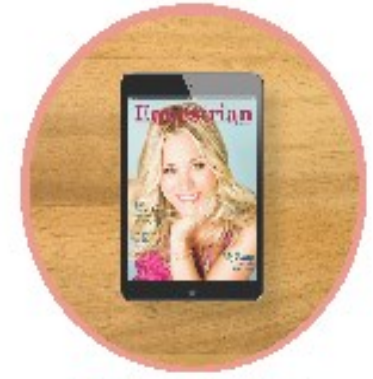
Equestrian The official magazine of the USEF