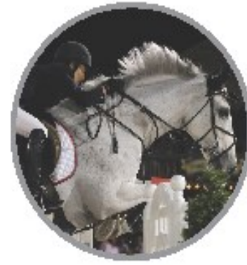
USEF NETWORK.COM Changing the way you look at equestrian sport