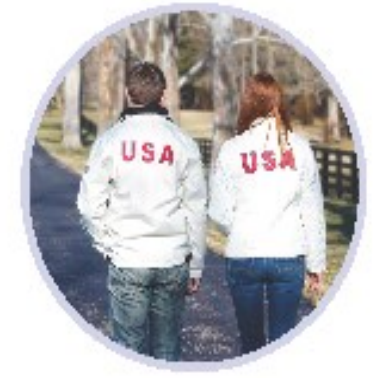
shopUSEF.com A fresh approach to classic equestrian style