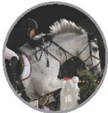
USEF NETWORK.COM Changing the way you look at equestrian sport