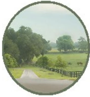
UNITED STATES EQUESTRIAN FEDERATION The national governing body for equestrian sport

Bill Russell Memorial Horse Show to Benefit Stroke Victims (331379) is rated "A" Green Working Hunter, Green Confirmation Hunter, Regular Working Hunter, Regular Confirmation Hunter, Amateur Owner Hunter, Junior Hunter, Green Pony Hunter, Pony Hunter High Performance Hunter, Performance Hunter; rated "C" Hunter Breeding, Pony Hunter Breeding, Pre-Green Hunter, Children's Hunter, Adult Amateur Hunter, Children's Pony Hunter.