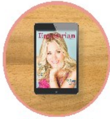
Equestrian The official magazine of the USEF