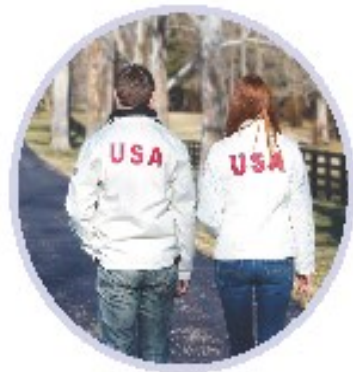
shopUSEF.com A fresh approach to classic equestrian style